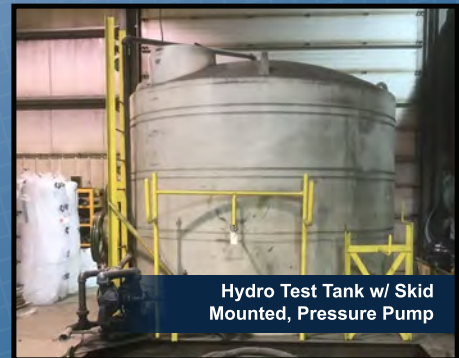
Hydro Test Tank w/ Skid Mounted, Pressure Pump