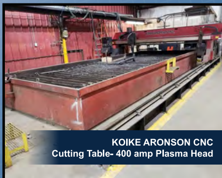
KOIKE ARONSON CNC Cutting Table- 400 amp Plasma Head