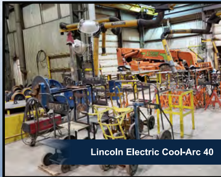
Lincoln Electric Cool-Arc 40