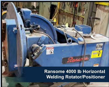
Ransome 4000 lb Horizontal Welding Rotator/Positioner