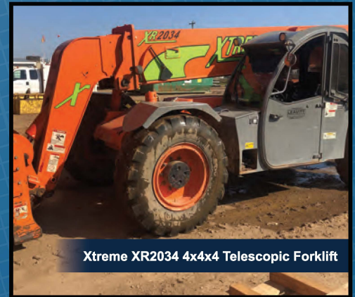
Xtreme XR2034 4x4x4 Telescopic Forklift