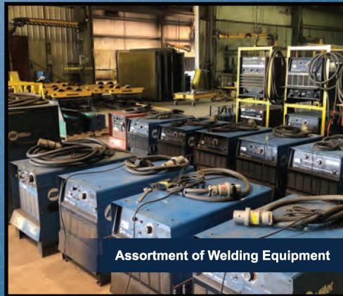
Assortment of Welding Equipment