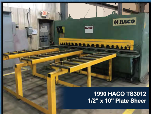
1990 HACO TS3012 1/2" x 10" Plate Sheer