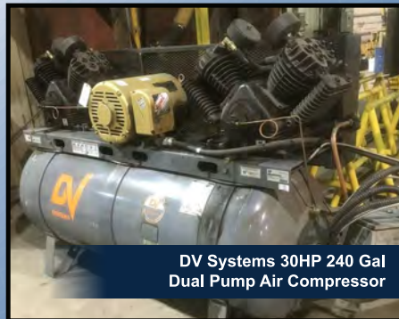
DV Systems 30HP 240 Gal Dual Pump Air Compressor