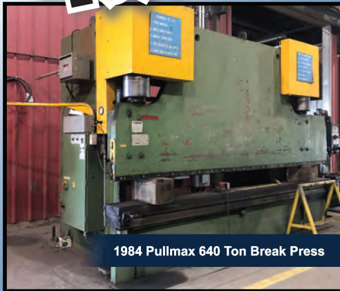
1984 Pullmax 640 Ton Break Press

WED. JULY 17 (SALE DAY) – WED. JULY 24 2019, 8AM - 5PM