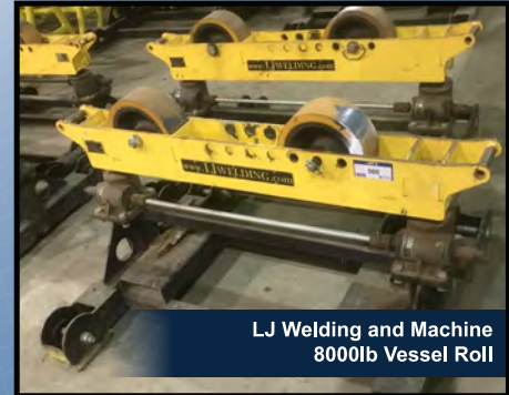
LJ Welding and Machine 8000lb Vessel Roll