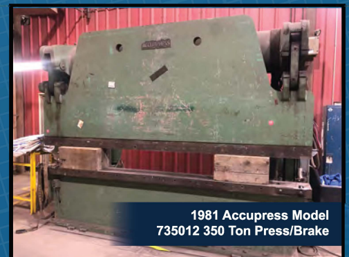
1981 Accupress Model 735012 350 Ton Press/Brake

Over 40 years of Auction & Liquidation Experience VIEW, JOIN AND BID AT CLUBBID.COM