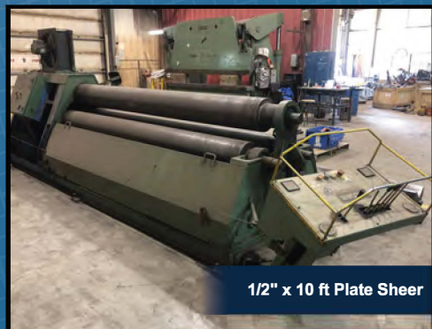
1/2" x 10 ft Plate Sheer