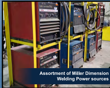
Assortment of Miller Dimension Welding Power sources