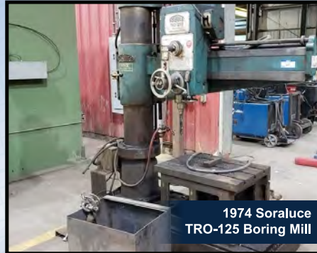
1974 Soraluce TRO-125 Boring Mill