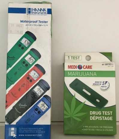
Lot of (1) Hanna Instruments Waterproof Tester & (1) Marijuana Drug Test

CONSIGN with Century Auctions 403.269.6600