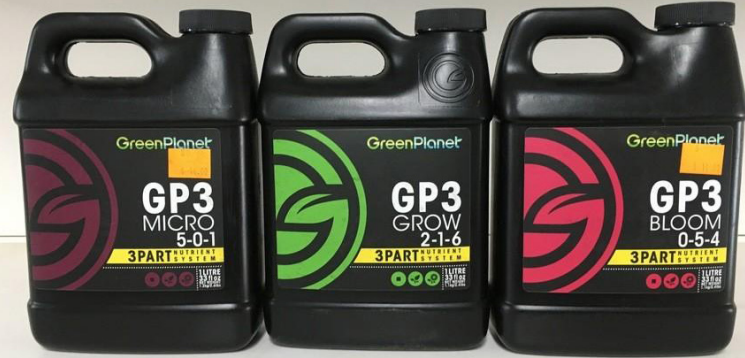
3 Part Nutrient System (1L) GP3, Micro(5-0-1)/Bloom(0-5-4)/Grow(2-1-6)