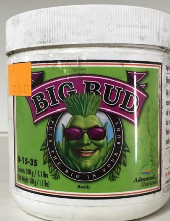
Big Bud Advanced Nutrients 500g Powder, (0-15-35)