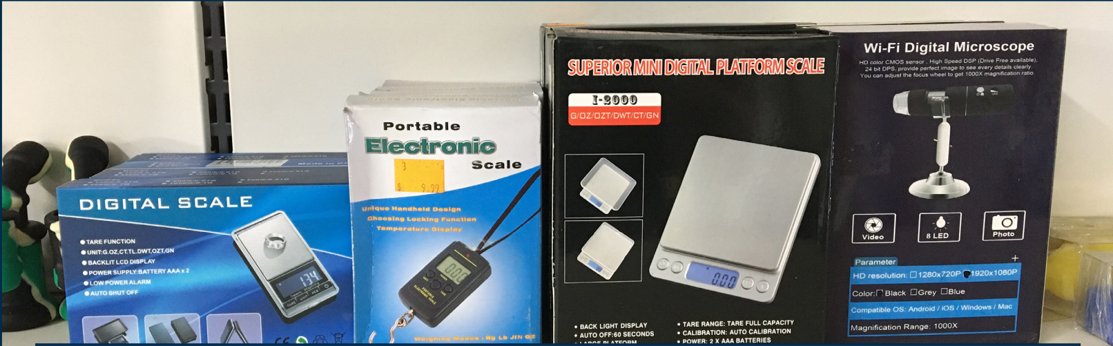
Assorted Digital Scales