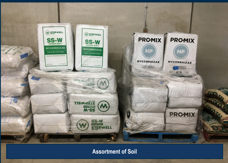
Assortment of Soil