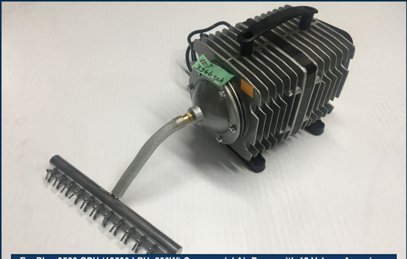
EcoPlus 3566 GPH (13500 LPH, 200W) Commercial Air Pump with 12 Valves, Aquarium, Fish Tank, Fountain, Pond, Hydroponics (1/2)