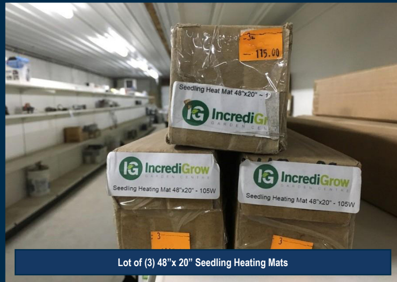
Lot of (3) 48"x 20" Seedling Heating Mats