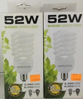
Lot of (4) 52W 6400K Horticulture Light Bulbs