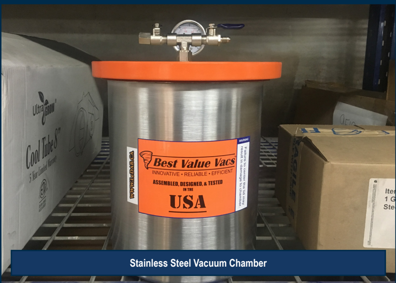
Stainless Steel Vacuum Chamber