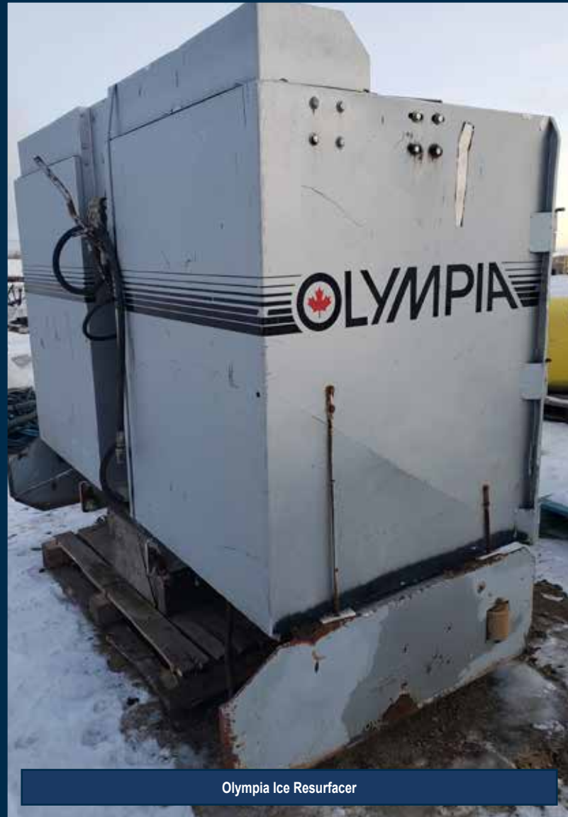
Olympia Ice Resurfacers