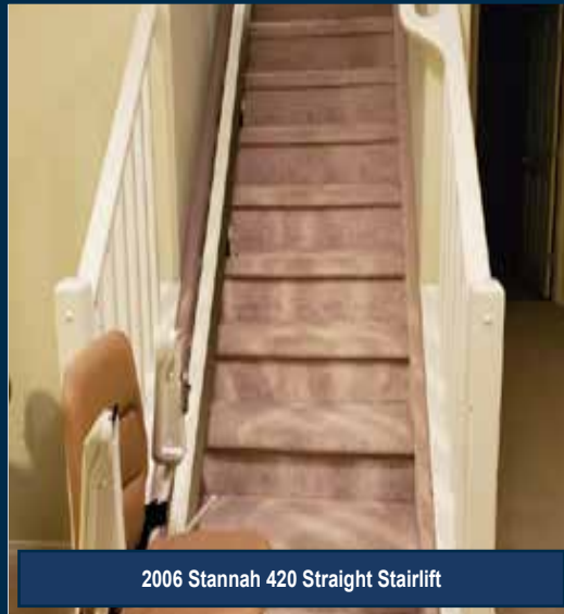
2006 Stannah 420 Straight Stairlift