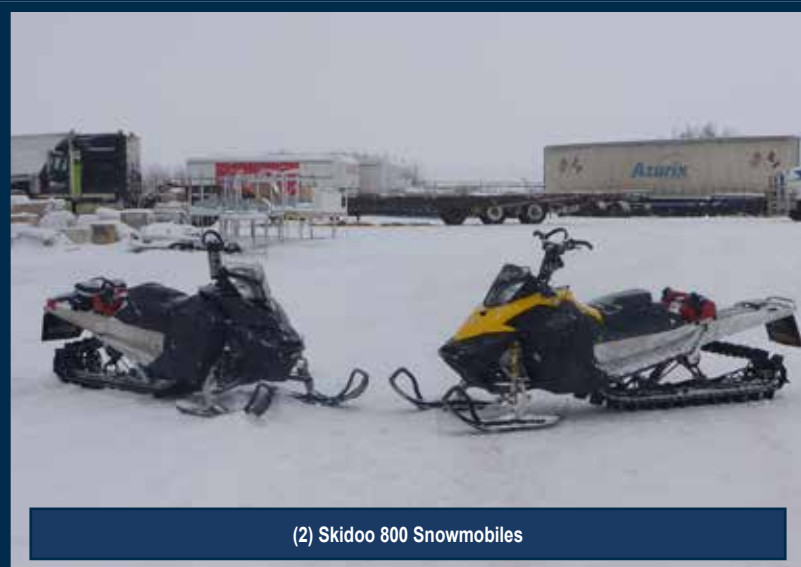
(2) Skidoo 800 Snowmobiles