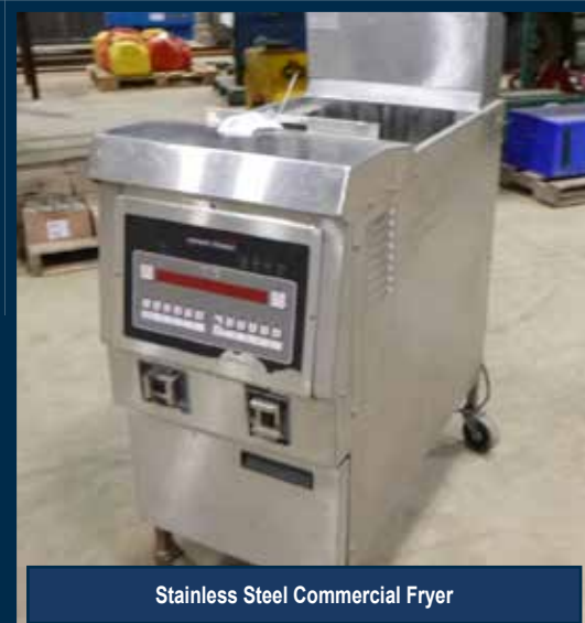
Stainless Steel Commercial Fryer