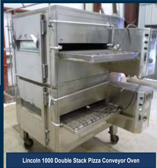
Lincoln 1000 Double Stack Pizza Conveyor Oven