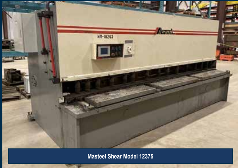
Masteel Shear Model 12375