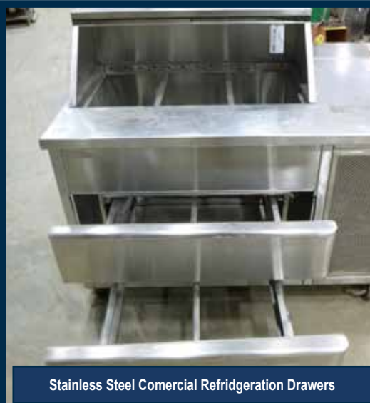
Stainless Steel Commercial Refrigeration Drawers