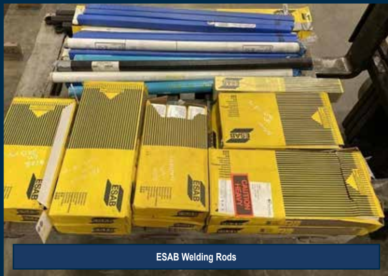
ESAB Welding Rods