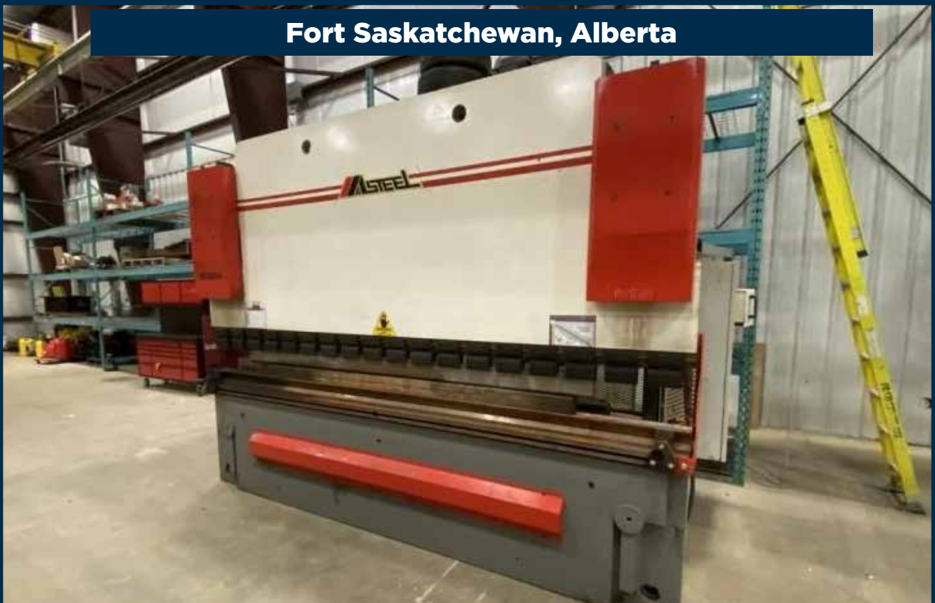
Masteel Brake Press Model M8HSA