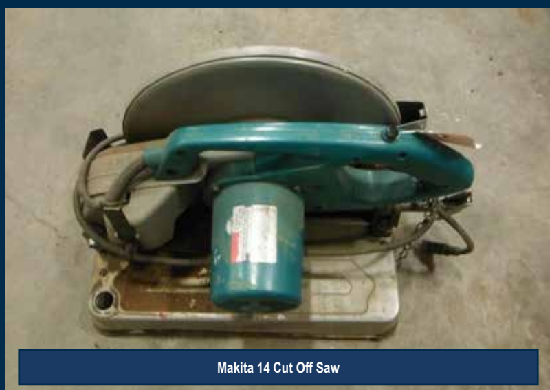
Makita 14 Cut Off Saw